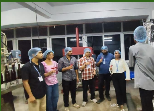
WINERY VISIT TO NASHIK