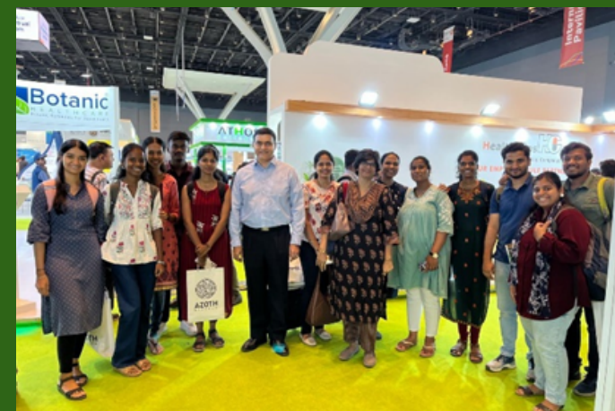
VITAFOODS EXHIBITION AT JIO CONVENTION CENTER FOR NUTRA EXPO