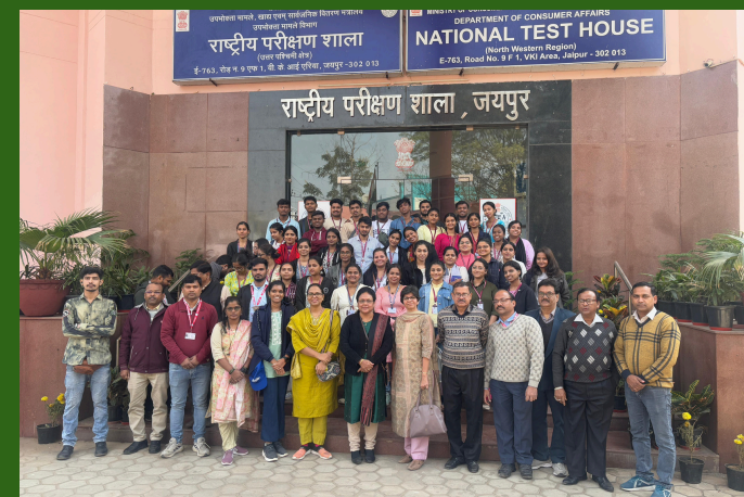
INDUSTRIAL VISIT TO JAIPUR