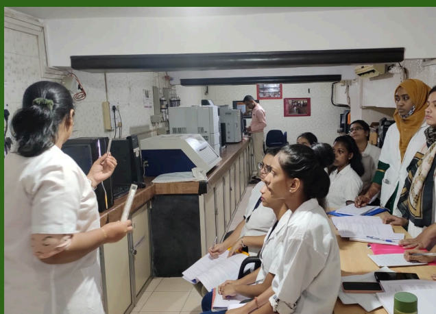
HANDS-ON TRAINING ON INSTRUMENTS